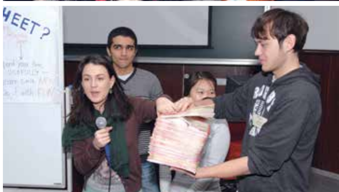
AUCA & KIMEP UNIVERSITY STUDENT FELLOWS ENGAGED IN TEAM EVENTS AT U.S.-CAEF CONFERENCE