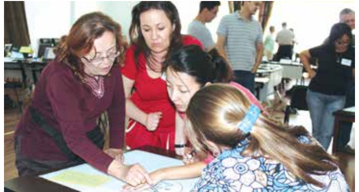
AUCA & KIMEP UNIVERSITY FACULTY FELLOWS WORKING ON A TEAM PROJECT

The Fairfield professors concluded their trip to Central Asia by conducting a special lecture, “Squashing Innovation by Protecting It: An Examination of Entrepreneurship in a Changing Environment,” for U.S.-CAEF alumni and current Fellows on June 18, 2013 in Bishkek. This presentation explored issues related to intellectual property from three perspectives: economics and externalities, ethics and violence, and writing and plagiarism. The topics aroused great interest and led to lively discussions between the presenters and audience members.