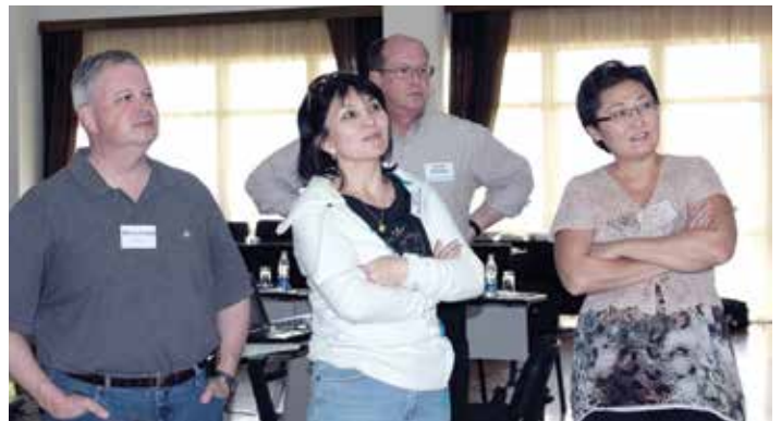
FACULTY WORKSHOP IN ISSYK-KUL, KYRGYZ REPUBLIC, JUNE, 2013