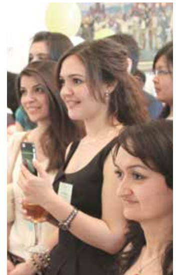
U.S.-CAEF GRADUATION RECEPTION IN ALMATY, 2013