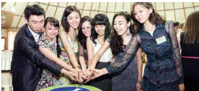
AUCA GRADUATING CLASS 2013